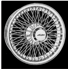
D472, 72 spoke