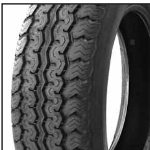
Vredestein 185/70 SR15 Vredestein 185/70 HR15