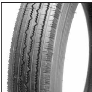
Dunlop 450 x 19