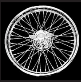
MGTC, 48 spoke