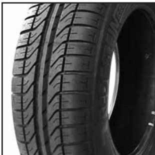
Vredestein 195/70 TR15 T-Trac