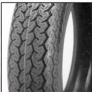
Vredestein 155 SR15 Sprint Classic Vredestein 185 HR15 Sprint Classic Vredestein 185 HR16 Sprint Classic