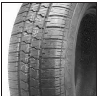
Pirelli P4000 205/70 WR15