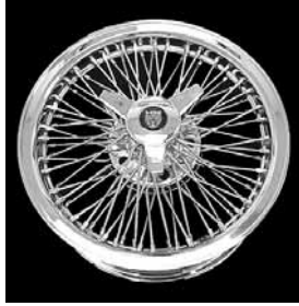
BB5E Aluminum 16 x 7.5", 70 spoke