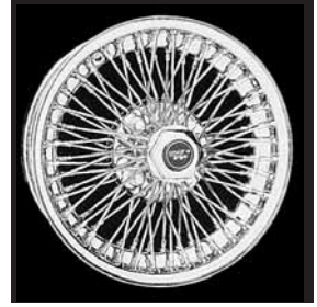
BB5E Bolt-on, 70 spoke