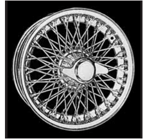
D457 F, 72 spoke