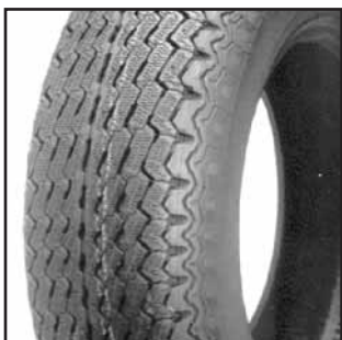
Dunlop 185HR15 SP Sport, ER70HR15