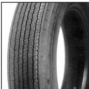
Dunlop RS5 590/15, 640/15, 600/16