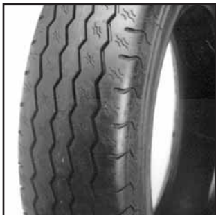
Avon 185VR16 Turbosteel

We have other brands and sizes in stock.