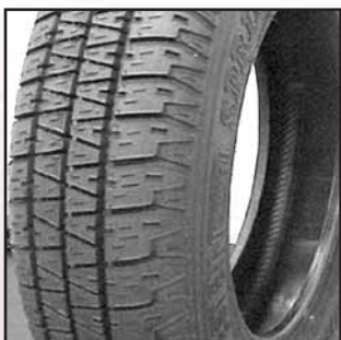
Vredestein 155TR13 Sprint+ Vredestein 165SR14 Sprint+ Vredestein 175SR14 Sprint+ Vredestein 165SR15 Sprint+