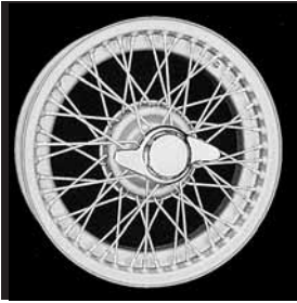
D450, 48 spoke