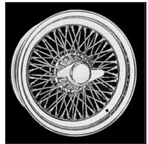
D464, 70 spoke