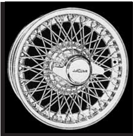
D455, 72 spoke